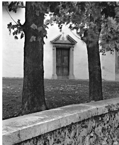
Church Door & Trees, Italy 4 x 5 negative - enlargement