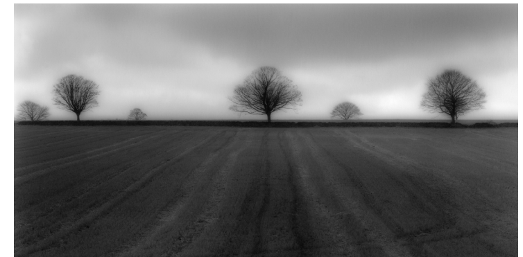
Trees, Cotswolds, England 4 x 5 negative - enlargement