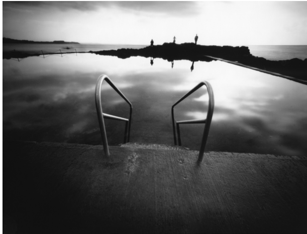
Portrait of 3 People, Kiama, Australia 10 x 8 Pin Hole photograph - contact printed