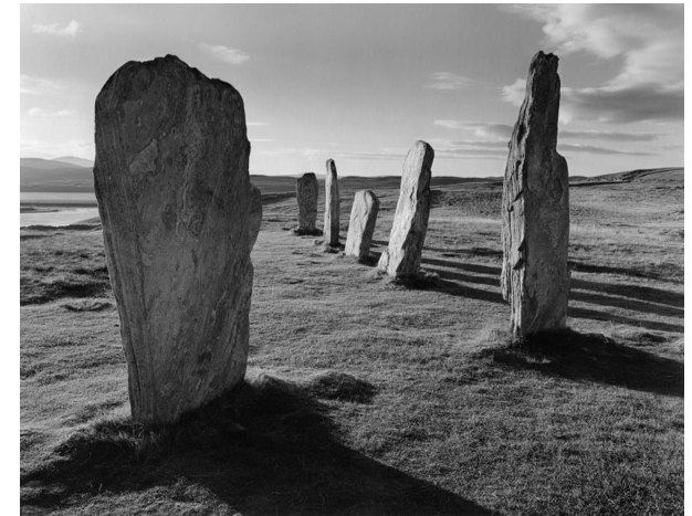
Calanais Stones, Outer Hebrides, Scotland 4 x 5 negative - enlargement